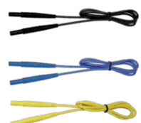
Test lead 1.2 m CAT III/1000V CAT IV/600V black/blue/yellow