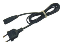
230 V power cord (IEC C7 plug)