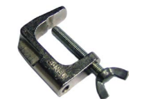
Clamp terminal with banana plug termination