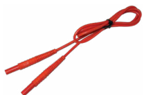
Test lead with banana plugs; 1 kV; 1.2 m; red