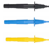
Pin probe CAT III/1000V CAT IV/600V black/blue/yellow