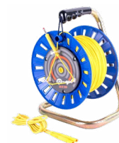
Test lead 75 / 100 / 200 m yellow, for MRU (banana plugs, on a reel)

WAPRX075BUBBSZ WAPRX100BUBBSZ WAPRX200BUBBSZ