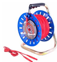
Test lead 75 / 100 / 200 m red, for MRU (banana plugs, on a reel)

WAPRX075REBBSZ WAPRX100REBBSZ WAPRX200REBBSZ