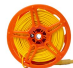
Earthing measurement test lead with banana plugs on reel; 50 m; yellow