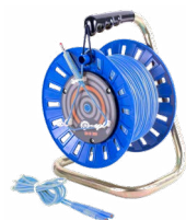
Test lead 75 / 100 / 200 m blue, for MRU (banana plugs, on a reel)

WAPRX075REBBSZ WAPRX100REBBSZ WAPRX200REBBSZ