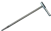
2x earth contact pin probe (30 cm)